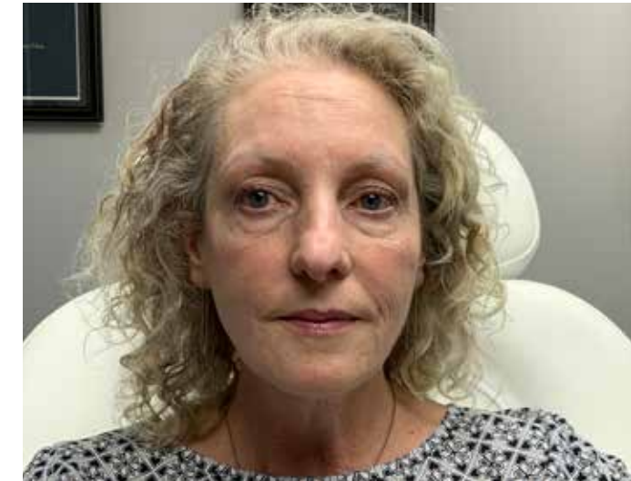
After Botox & filler